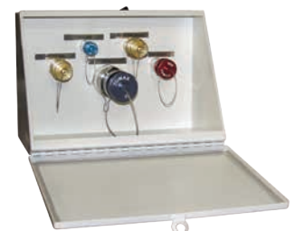
receivers sold separately